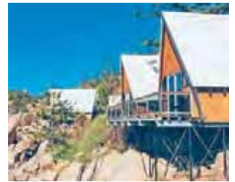
Stay at Base Hostel nestled in the bush on Magnetic Island, Queensland