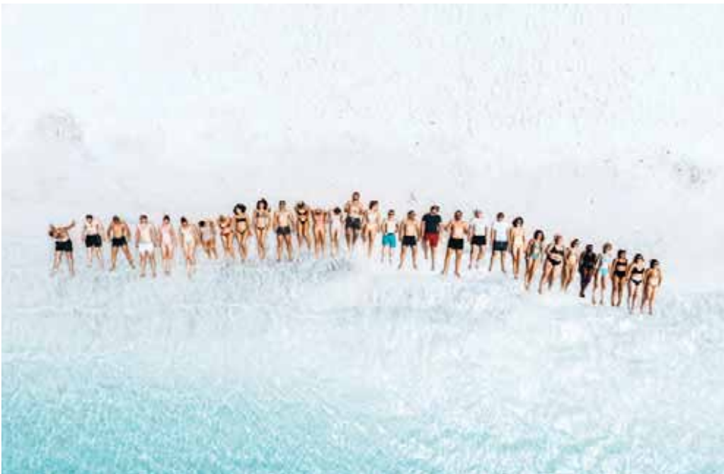
Kick back on the white sands of the 'world's best beach', The Whitsundays @max_homer

THE ONE THAT BRINGS YOU THE BEST OF QUEENSLAND, INCLUDING WHITSUNDAYS BEACHES & THE GREAT BARRIER REEF