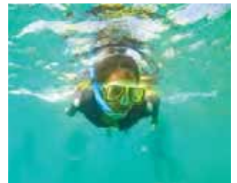
Snorkel the Great Barrier Reef, Queensland