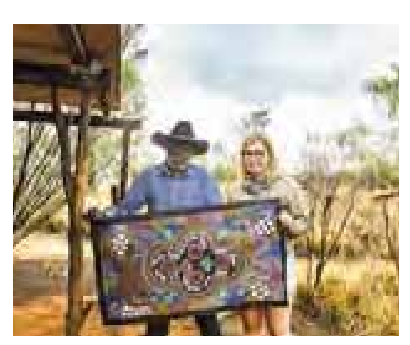
Aboriginal art, Uluru, Northern Territory @annaholling