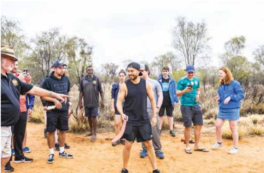
Pudakul aboriginal culture experience, Pudakul, Darwin