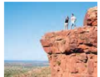
Gaze over the stark beauty of Kakadu