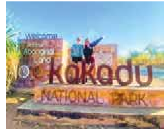
Find rainforests and rock art at Kakadu National Park, Northern Territory