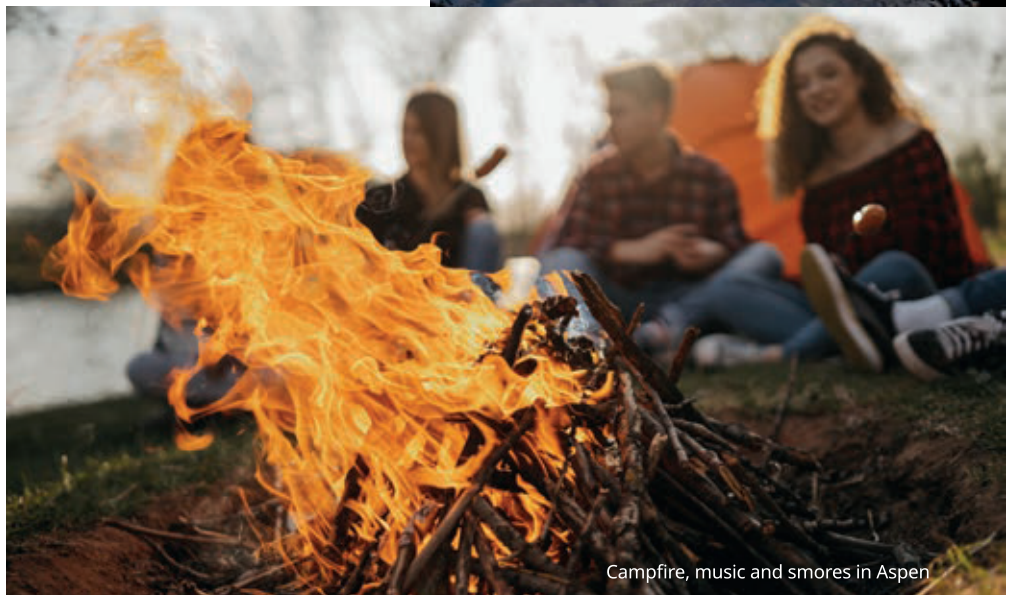
Campfire, music and smores in Aspen