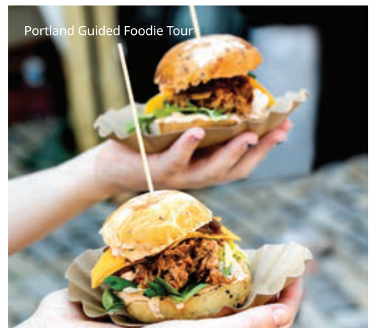
Portland Guided Foodie Tour