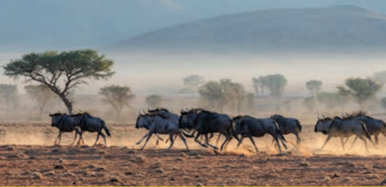
DISCOVER ALL YOUR INCLUDED ESSENTIALS AND TAILORING OPTIONS AT COSTSAVERTOUR.COM