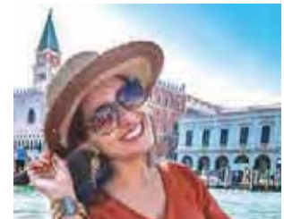
Cruise the canals of Venice, Italy @brunabarela