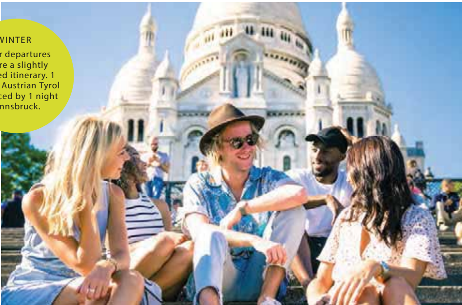
Discover laidback Montmartre, Paris

WINTER Winter departures feature a slightly modified itinerary. 1 night in Austrian Tyrol is replaced by 1 night in Innsbruck.