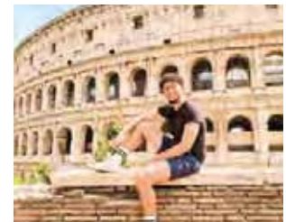
Roam the ruins at the Colosseum, Rome, Italy