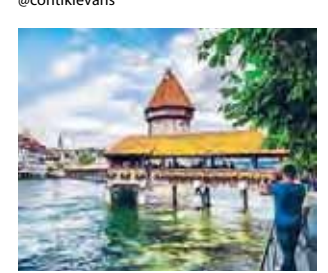
Wooden Chapel bridge, Lucerne