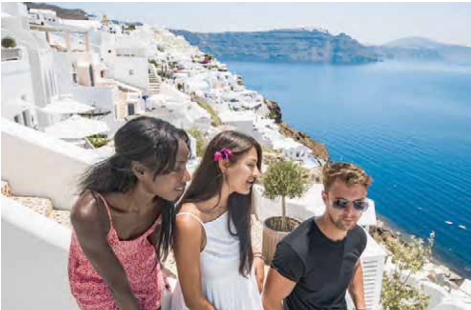
Enjoy spectacular views over the sparkling Mediterranean, Santorini