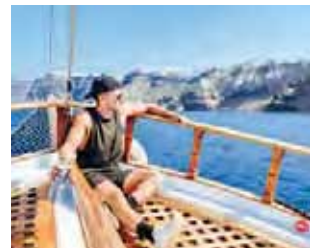
Bliss out on a boat in the Greek Islands @derekisfine