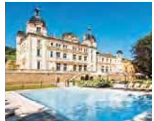
Contiki's 16th Century French Chateau