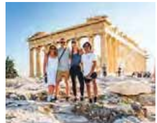
See The Parthenon, Athens, Greece @taylor.parkes