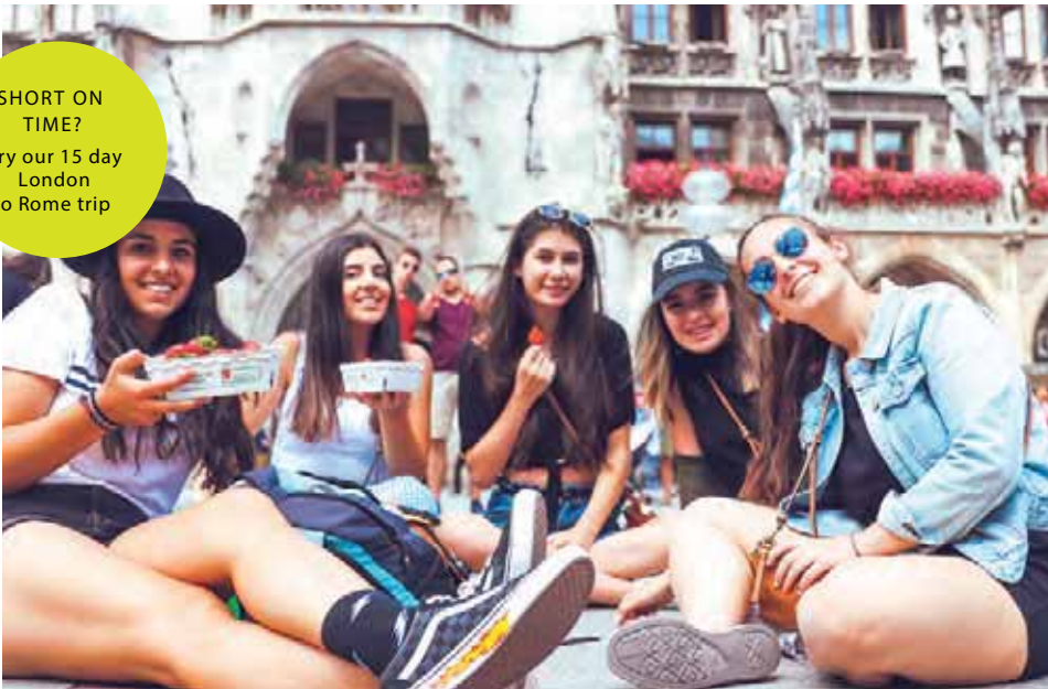
See Gaudi's iconic architecture throughout Barcelona, Spain

SHORT ON TIME? Try our 15 day London to Rome trip