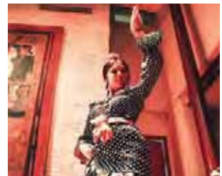
See a flamenco show, Barcelona, Spain