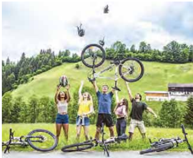
Explore the Austrian Tyrol on two wheels