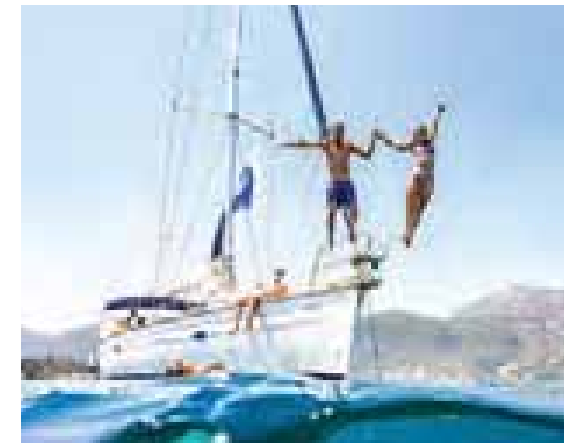
Cool off with swim stops, Naxos