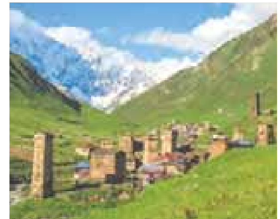
Marvel at towers dating back to the 9th century, Svaneti, Georgia

SEE FULL TRIP DETAILS AT CONTIKI.COM/BEST-OF-GEORGIA