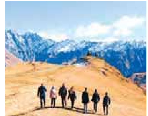
Get the best views of the Caucasus Mountains, Georgia