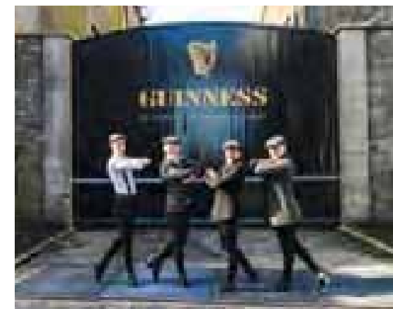
Dance at the Guinness Storehouse, Dublin

SCOTLAND? YES PLEASE! Fancy getting a taste of Scotland, too? This place is a different world, with its ancient castles, world class distilleries, spectacular mountains & fairytale islands. You'll get to try it all on our incredible 13 day trip. See contiki.com/scotland-ireland for details & prices.