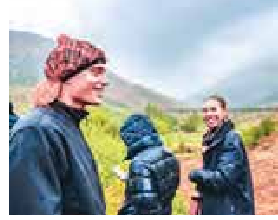
Bask in the beauty of the Highlands, Scotland