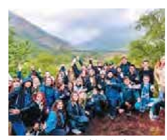
Pose for a pic in front of the Glenfinnan Viaduct, Highlands, Scotland