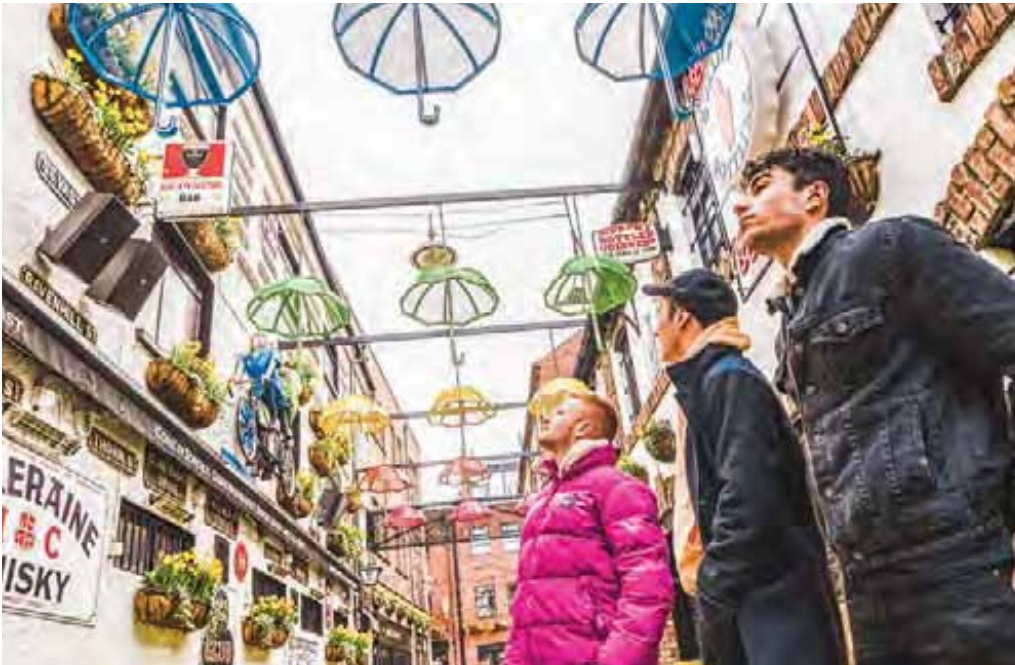
Explore Dublin & seek out the perfect spots for guzzling Guinness, Dublin, Ireland

THE ONE THAT GIVES YOU THE BEST OF BRITISH CULTURE, TOPPED OFF WITH THE EMERALD ISLE