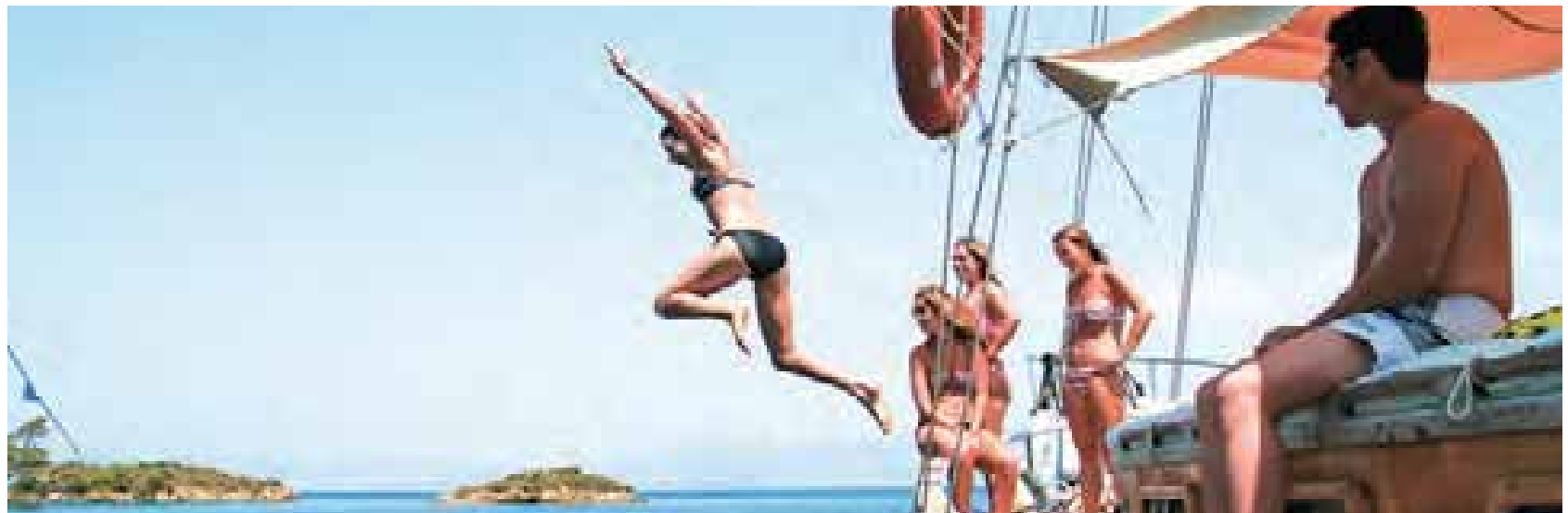
Cruise with your crew on a traditional sailboat, Turkey