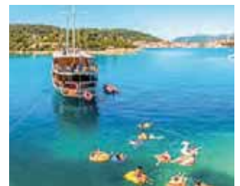
Take a dip in the Adriatic Sea, Croatia