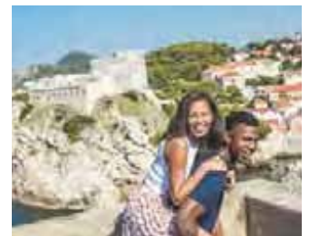
Explore the walled city of Hvar, Croatia