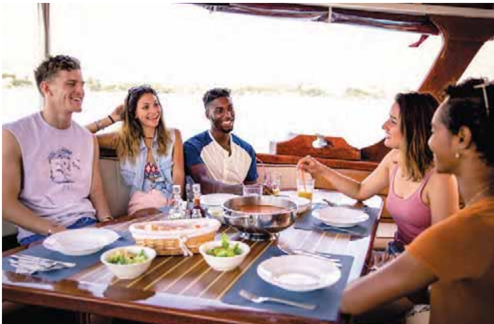
Sail the Dalmatian Coast, Croatia

THE ONE THAT SEES YOU CRUISE THE DALMATIAN COAST & DISCOVER HVAR, SPLIT & DUBROVNIK ABOARD A SAIL BOAT