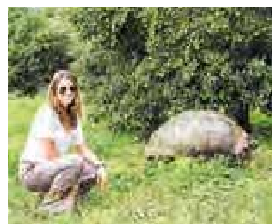
Meet the famous giant tortoises, Isabela Island