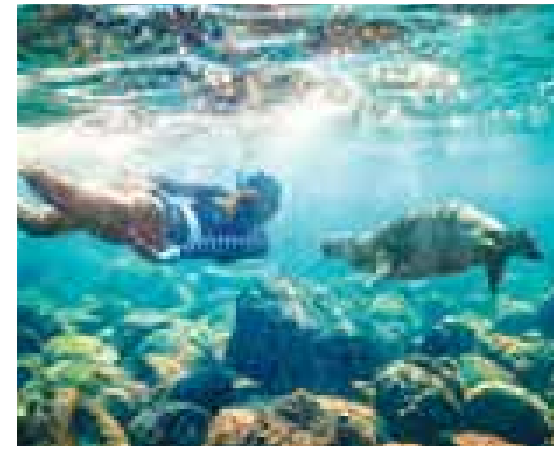
Meet the friendly locals of the Galapagos Islands, Equador @simplysantos